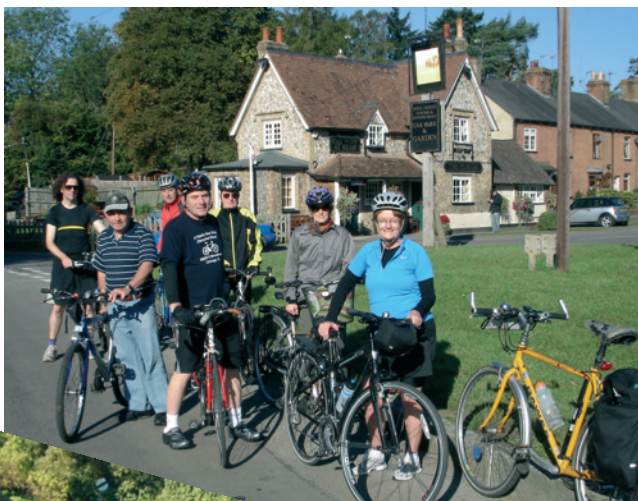
The Plough at Belsize Chilterns Ride 15 October